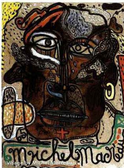
Visage by Michel Macreau

Powerful shades of red and blue wonder worlds of Masson and Kandinsky punctuated by the clean lines of statuary and iconic black and white photographs. This is the universe of Art Elysées bringing together some 60 leading galleries from Paris, the French provinces and abroad into a dreamy ephemeral world that emerges like a desert mirage on the Champs-Élysées for four days in October.