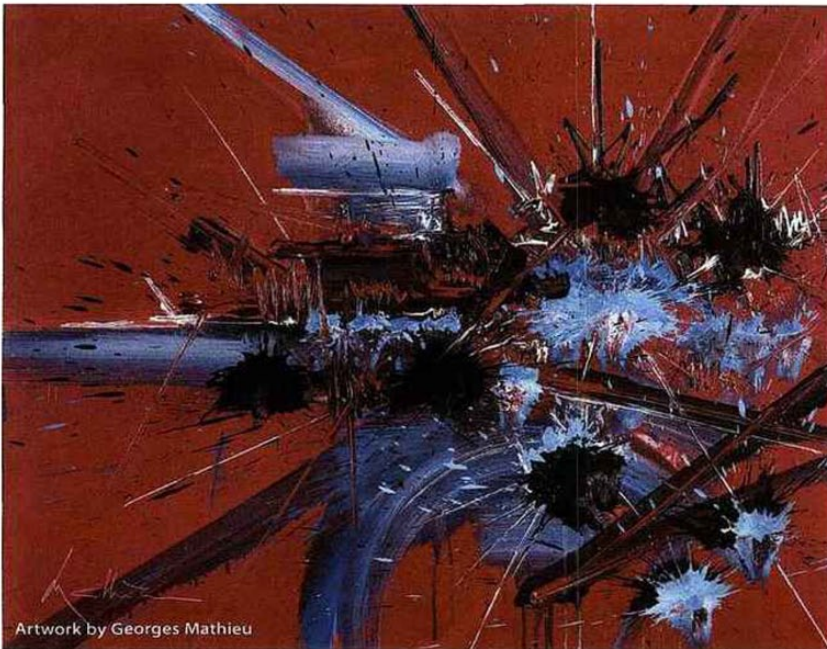
Artwork by Georges Mathieu